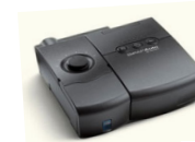
Invacare 5 Liter Oxygen Concentrator