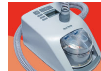
Resironics BiPAP Auto

Fisher & Paykel CPAP with heated humidification and Nasal mask.