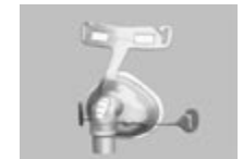
ResMed Full Face Mask